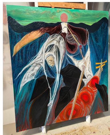
9 Drawings, 2008-2018 see PDF on website exhibition page