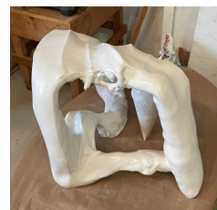
The Vengeance of Hop-Frog (Ptg. No. 255), 2020-2022